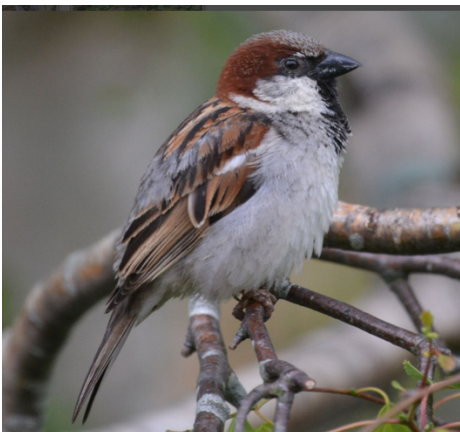
Male – grey 'cap' and speckled black 'bib'.