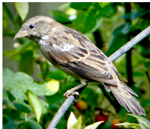
Female – streaky brown with a thick beak