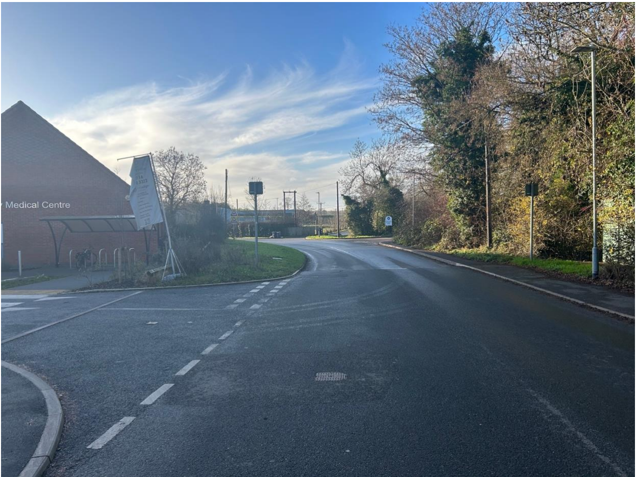
Ratby Parish Council, 13 Station Road, Ratby LE6 0JF.